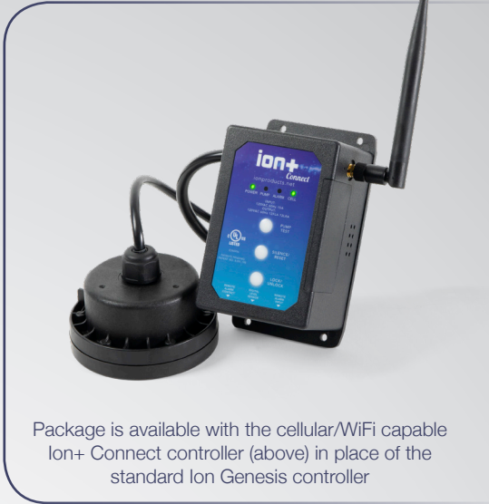
Package is available with the cellular/WiFi capable ion+ Connect controller (above) in place of the standard Ion Genesis controller